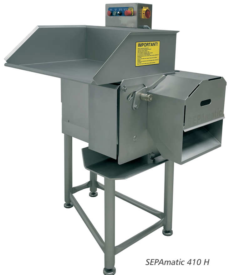
SEPAmatic 410 H

The unprocessed meat is conveyed to the perforated drum by a flexible and highly wear-resistant polyurethane crusher belt, the uniformly increasing pressure forcing the soft meat through the perforations into the drum while the larger and firmer parts (sinews, cartilage, etc.) are held back on the outside of the drum and removed by scrapers. The meat's natural fibre structure is retained, since the meat is merely briefly strained but not grated, ground or heated in any way.