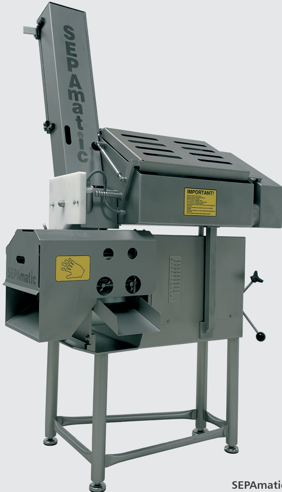
SEPAmatic 410 P ST